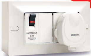
AC BOX with SP MCB